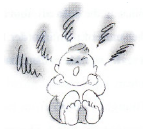
Inner Child that craves for love 41

Similarly, children also need the love from their parents. If they are disliked, they won't be able to live. Moreover, they are still very vulnerable. Once having grown into a child, they will become able to communicate their intention although they are often still