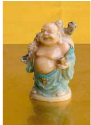
Figure 6 Hotei