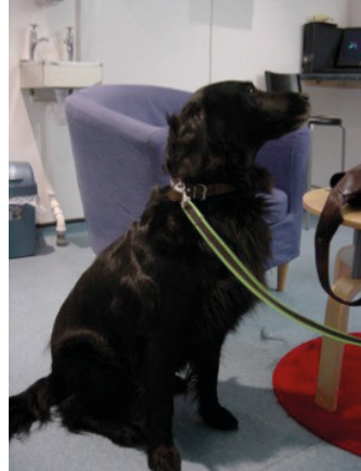
‘Gemma’ The name has been changed to protect her identity

The owner described Gemma as a very obedient dog who had never been ‘naughty’ like her mother and sister. ‘She wants loving all the time, and is so willing to please. My husband doesn’t like them in the kitchen and now as soon as she hears his car coming she slinks off into another room on her own. She loves going shooting with him and is a really good working dog but she is so sensitive if he tells her off and is upset for the rest of the day. I really feel for her when this happens, as she is so mortified. Even though the others are far more naughty, somehow he gets angrier with her than he does with the others if she does anything wrong, as he doesn’t expect it from her. I think he finds her obedience somehow annoying and he thinks she is bland despite her being one of the best working dogs we have had.’